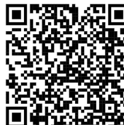
Volunteer Sign Up

VBS June 17, 2024 - June 21, 2024 "Who is My Neighbor"